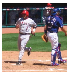
The runner (red helmet) touches home base and scores a run.

The game cannot end in a TIE. If the score is tied after nine innings, then the game continues until one team has more total runs after a complete inning.