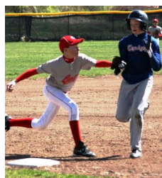
This defender (red hat) puts out a runner by touching him with the ball.