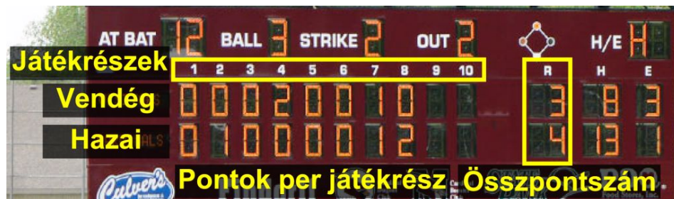
A typical scoreboard